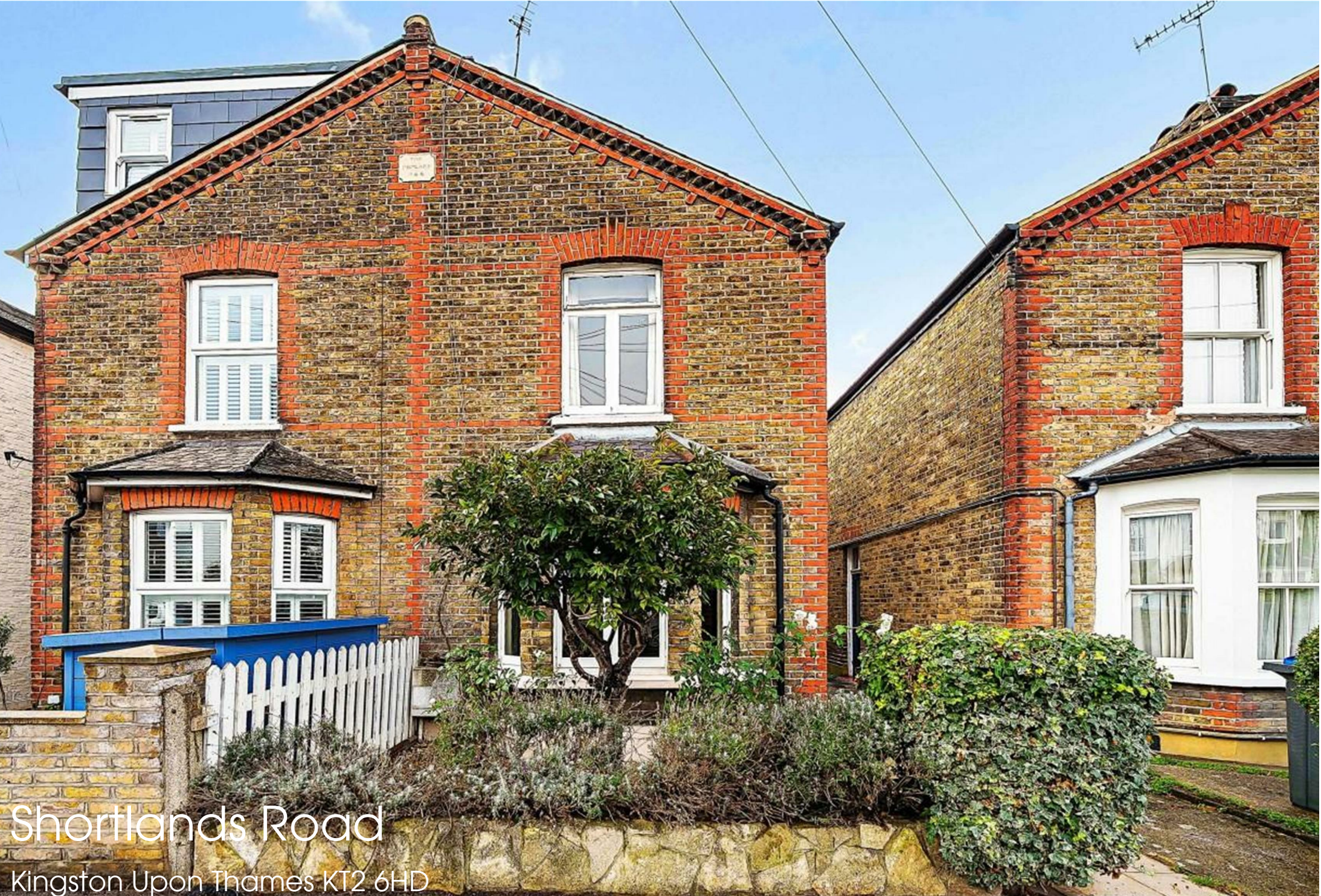
Shortlands Road Kingston Upon Thames KT2 6HD